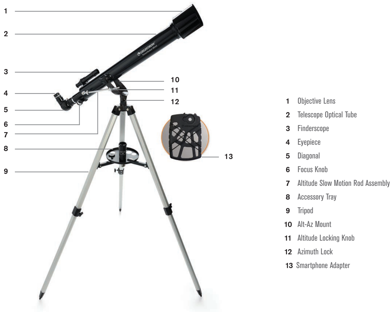
Figure 1-1 PowerSeeker 60AZ Refractor